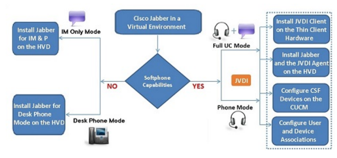
Figure 2: Do You Need Cisco Jabber Softphone for VDI?

A Cisco Jabber Softphone for VDI deployment consists of the following components: