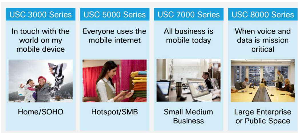
Figure 1. Cisco Universal Small Cell Portfolio

The Cisco ® Universal Small Cell 8050 Enterprise Management System (USC 8050 EMS) is part of the Cisco Universal Small Cell Solution, an end-to-end platform that integrates 3G, LTE and carrier-grade Wi-Fi with self-organizing network (SON) and backhaul technologies for an efficient and highly secure heterogeneous network (HetNet). The Cisco USC platform provides the right solution for every indoor environment, from the home to enterprises of every size, up to large high-density environments such as airports, shopping malls, and campuses (Figure 1). The Cisco USC 8050 EMS is a centralized configuration, fault, and performance-management system that allows mobile operators to manage multiple Cisco USC 8000 Series small cells through a powerful and easy-to-use graphical interface.