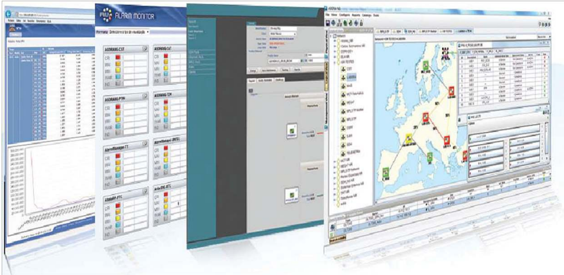
Figure 2. Cisco ME 4600 Series Agora-NG NMS Reference Architecture