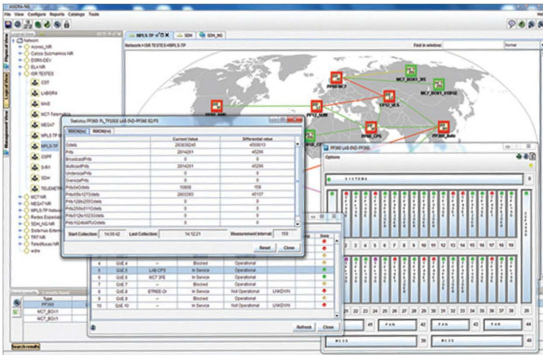
Figure 3. Cisco ME 4600 Series Agora-NG NMS Resource Manager Network Topology

The topology-management module provides graphical tools for operators to build the network topology (Figure 3). A hierarchical topology map is included, offering a real-time graphical representation of the network Inventory, with a color code to represent the network status. It also shows resource availability for each link, acting as a powerful tool for network traffic planning. Cisco ME 4600 Series Agora-NG Resource Manager includes a fault management module, the Alarm Monitor. It promotes the detection of network and service faults in real time and presents them as alarms in an intuitive web-based interface. It correlates alarms, providing root cause analysis and information on how services are affected. It also provides alarm notification by SMS and email.