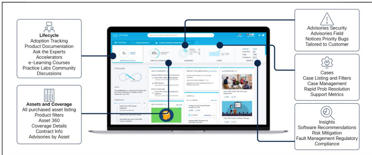
Figure 2. CX Cloud

To see how Success Tracks can drive faster adoption and ROI for your Catalyst-based enterprise network, connect with your Cisco representative and request a CX Cloud demo.