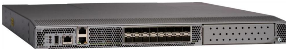
Figure 1. Cisco MDS 9132T 32-Gbps 32-Port fibre channel switch