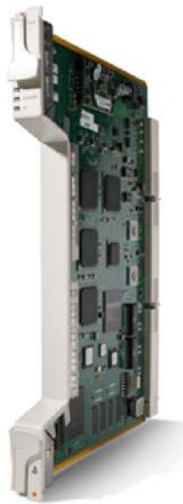
Cisco ONS 15454 SONET 12-Port DS-3 Transmultiplexer Card