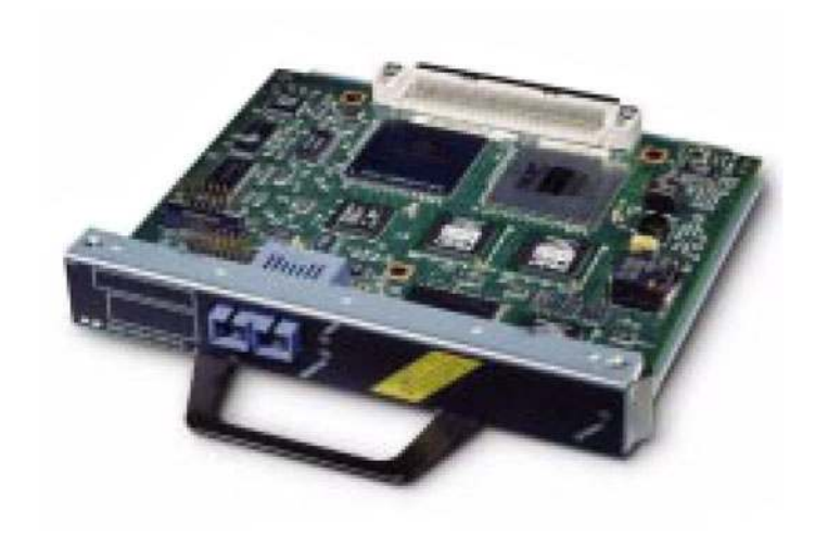
Figure 1 The Multichannel STM-1 Port Adapter

The PA-MC-STM-1 enables service providers to use a single fiber-optic circuit to provision 63 E1s—E1s that normally require 63 separate copper pairs. The PA reduces wiring complexity, and, when spare capacity is available, it enables service providers to "turn up" new E1s without dispatching a technician to the router. For service providers with customers who require smaller circuits, the PA-MC-STM-1 supports as many as 256 channel groups and can provision circuits down to DS0—providing even more flexibility and density.