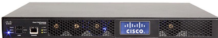
Figure 2. Cisco TelePresence MCU 5300 Series Is Standards-Based and Compatible with All Major Vendors' Endpoints