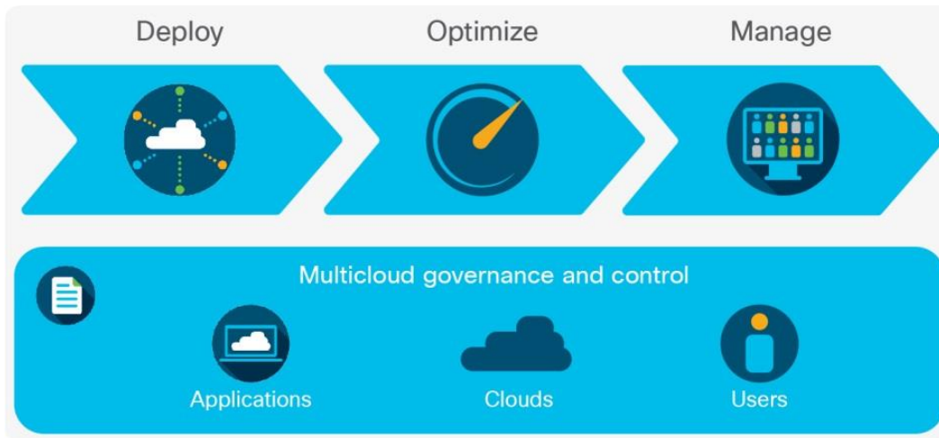
Figure 2. Multicloud lifecycle management