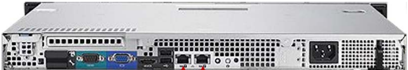
Management Port Monitor Port