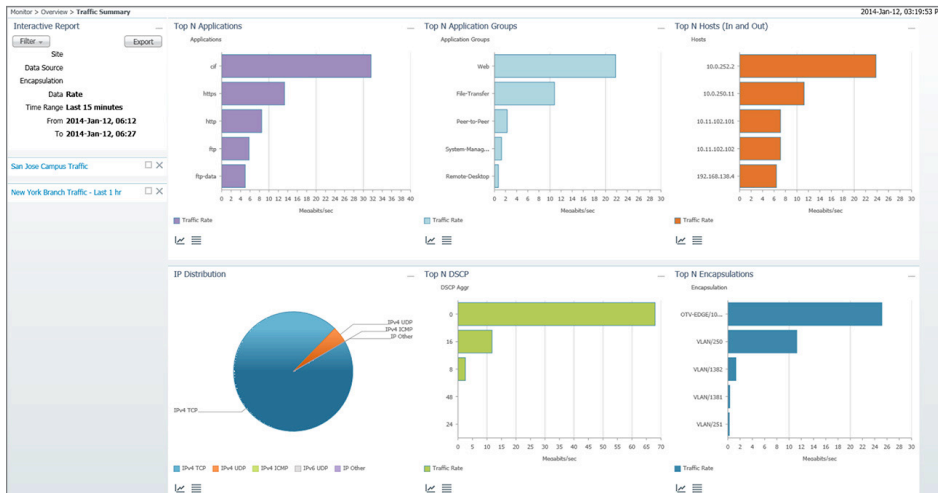
Figure 1. Traffic Summary View