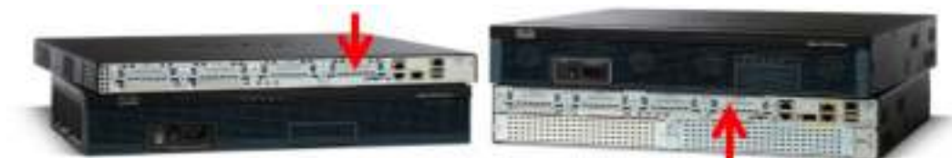
Figure 1. LTE eHWIC